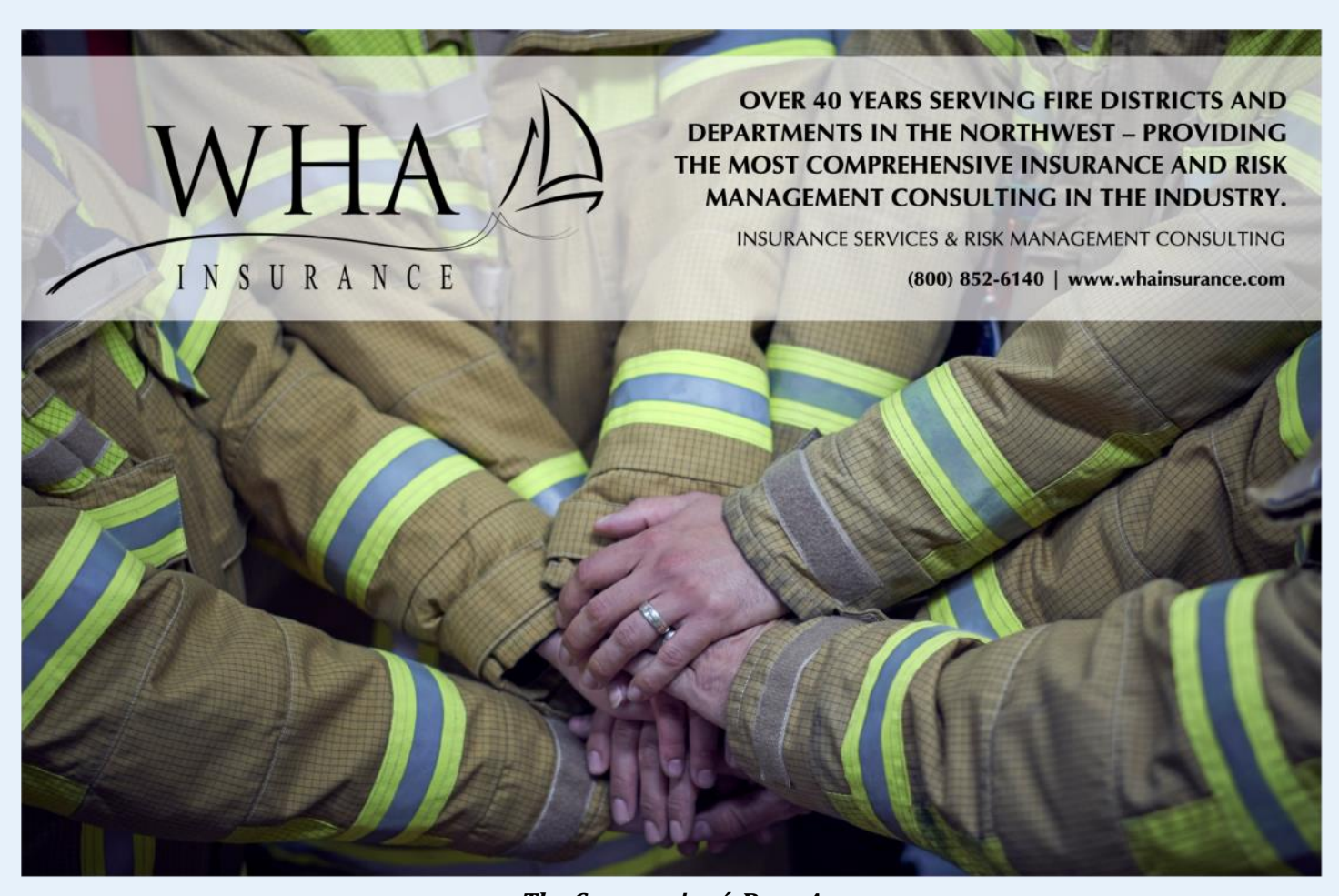
The Communiqué, Page 4

2023 OFDDA / SDAO Innovative Safety Award Recipient: Chiloquin Fire & Rescue