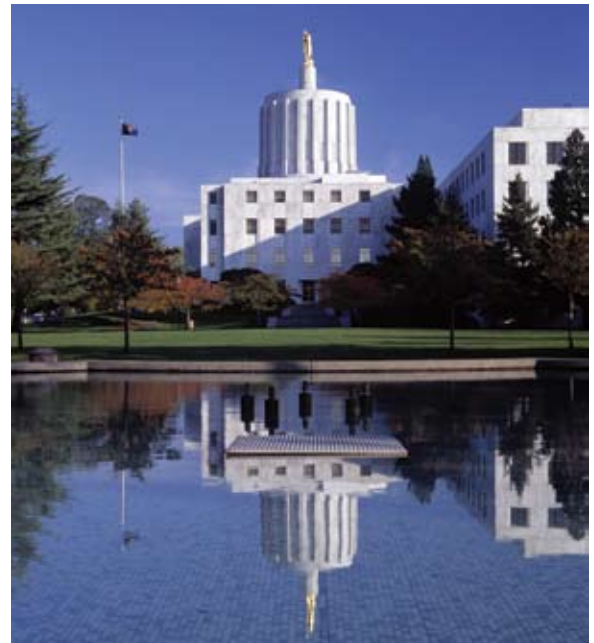
Oregon State Capitol.

Most Oregon Fire Districts already insure for local public body higher limits than we have recited above, however if your district has liability limits less than the ones stated, we urge you to contact your insurance agent as soon as possible and increase to at least the new amounts. These changes may result in higher liability costs in the future.